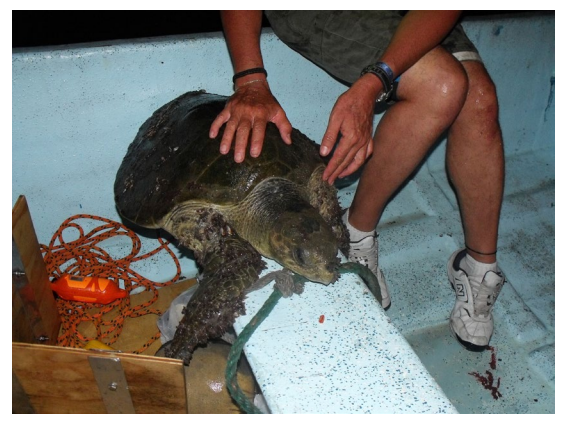
Research with the CastAway-CTD provided a foundation for better under-standing of the dynamic ecosystem of Manzanillo's harbor, lagoon and coastal habitat.