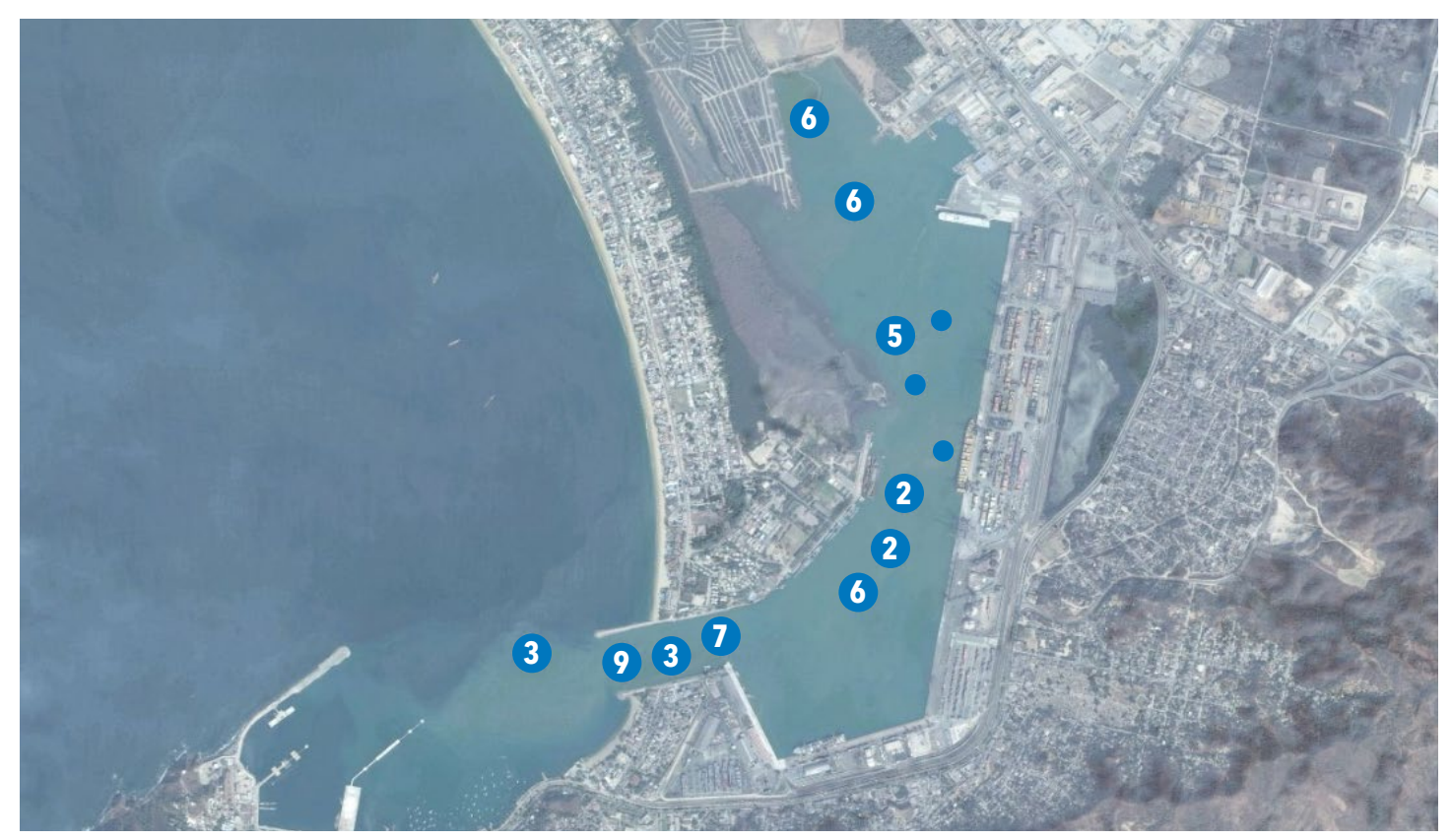
Gathering conductivity, temperature and depth data at multiple sites in Manzanillo harbor was easy with the one- pound CastAway-CTD. Results will guide the reconnection of the harbor with the freshwater lagoon to its north.